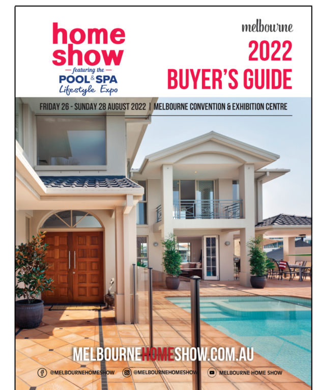
Buyer's Guide cover, August 2022

*Based on yearly attendance of all Home Shows